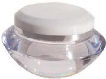
Lip Pot ½ oz

Slightly tinted, wear it as a top coat to your lipstick or on its own for a little shine. This delicious gloss will truly boost your sensual kiss powers, blended with natural fruit extract, Available in Tropical Punch, Strawberry, and Lemonade. $6.00